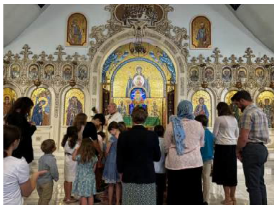
The blessing of our children on the first day of Church School .