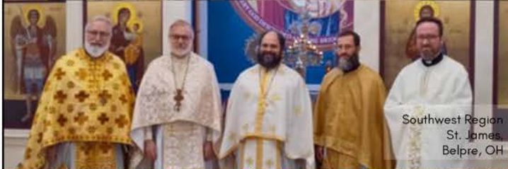
Southwest Region St. James, Belpre, OH