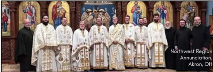
Northwest Region Annunciation, Akron, OH