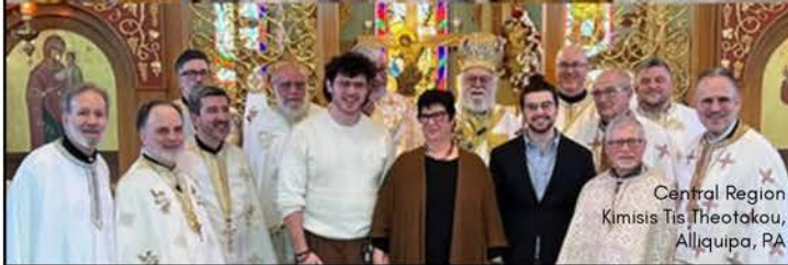
Central Region Kimisis Tis Theotokou, Alliquipa, PA

On Thursday February 6th, clergy from the Metropolis of Pittsburgh gathered to celebrate the Feast of St. Photios the Great, Patron of the Metropolis. Images from the regional celebrations in the Northwest, Southwest, and Central regions of the Metropolis, (East was cancelled due to inclement weather). May St. Photios watch over us!