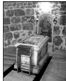
The tomb of Saint George

Saint George's big nameday is in April, but today we remember when the people built a church for Saint George. That was 1,700 years ago! We remember that special day even today because Saint George is such a special saint. That first church was destroyed. Then it was rebuilt. Then it was destroyed again and rebuilt again. This last one was built almost 150 years ago. You can visit it if you ever go to the Holy Land, in the Middle East. You can pray in this amazing place. Saint George's tomb (his body) is still there. And you can see how Saint George is important to us. And his prayers are powerful, too!