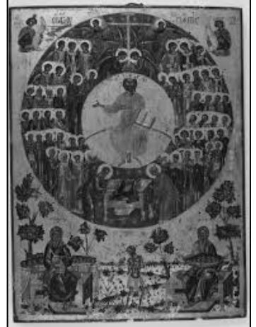
The saints put others first!

Can you think of something you can do for somebody else, even if it makes it a little bit harder for you? Can you spend some time helping somebody this summer? Can you make something or do something that will put somebody else first?