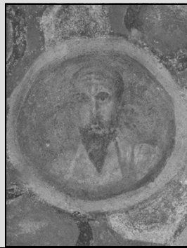
around 1,700 years ago

Did you know archaeologists have found pictures of this great saint from 1,700 years ago?