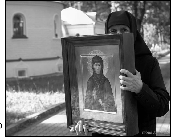
A nun holds a new icon of Saint Fomar, because she was just declared a saint

Have you ever met a saint? Maybe. Sometimes we might think of saints as living many, many years ago. But saints are alive among us today. That's because people who love God very, very much are around us today!