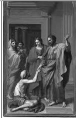
St. Peter healing a paralyzed man

So we see that Jesus really is "with us always." We know that He did all kinds of miracles when He lived on earth. But after He left for Heaven, He is still with us. We are never really all alone, because our Lord, Jesus Christ is with us. He told us He would be with us always!