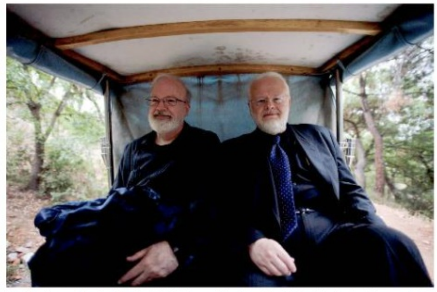
Jaunting through Turkey, Cardinal O'Malley and Metropolitan Methodius took a ride around the island of Halki during the joint Catholic-Orthodox pilgrimage in 2007.

One example of the Cardinal's fruitful ecumenical ministry is a 10-day pilgrimage to Rome, Constantinople, and St. Petersburg that he and I led in 2007.