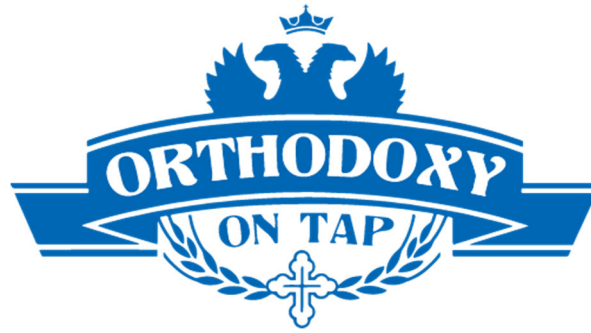
February 6th, Orthodoxy on Tap at Anatolia Restaurant