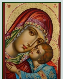
Salutations Service Icon