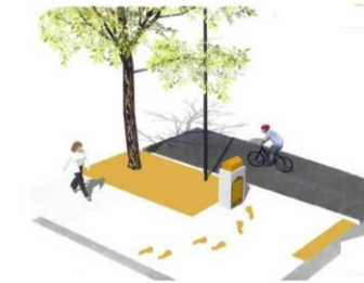
Drawing of Monument and surrounding area. Finished monument will be unveiled at ceremony.

Join us to dedicate and celebrate the newly created Monument honoring the original location of the Greek Orthodox Church of the Annunciation. We honor the pioneer spirit of the immigrants who sacrificed to build the church in 1921.