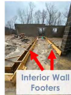
Interior Wall Footers