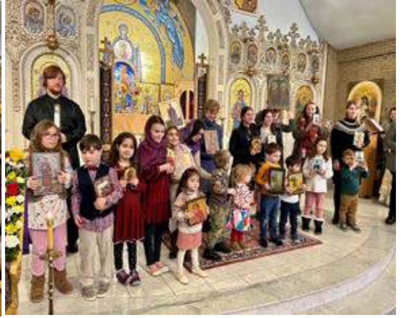
Photos from the procession of the holy icons from the Sunday of Orthodoxy

Kali Sarakosti! Blessed Great Lent to all of our Church School families!