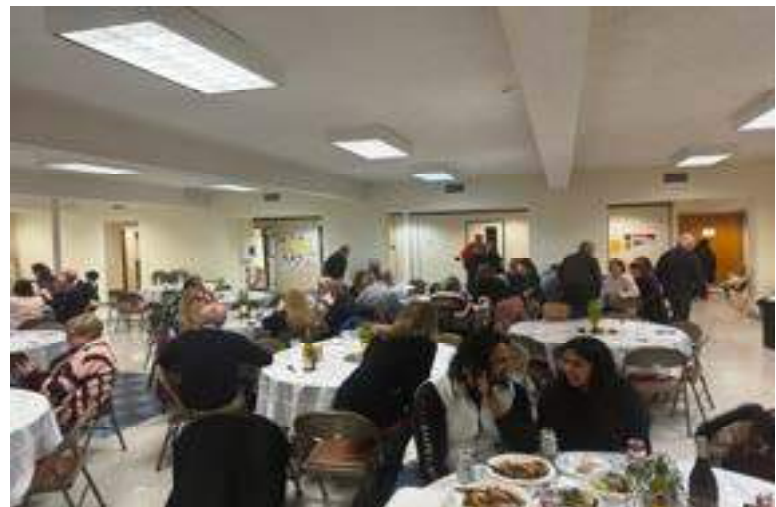
Photos from the Taverna Night