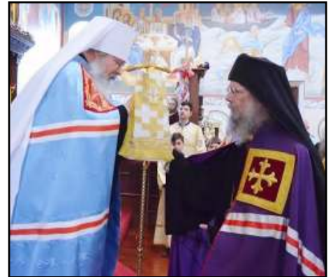
Metropolitan Tikhon presents archpastoral staff to newly enthroned Bishop Alexander.

A wealth of reports and documents, including the gathering's closing encyclical, is available on-line. ■ FULL STORY: https://oca.org/news/headline-news/holy-and-great-council-concludes-on-the-sunday-of-all-saints