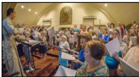
Symposium participants sing Saturday All-Night Vigil.

ISOCM works to increase awareness of Orthodox liturgical music and chant by hosting gatherings around the globe, publishing resources and proceedings from its events, and facilitating research studies that explore the many facets of Orthodox Christian music. ■ FULL STORY: http://oca.org/news/headline-news/isocm-symposium-celebrates-unity-in-diversity-of-orthodox-church-music